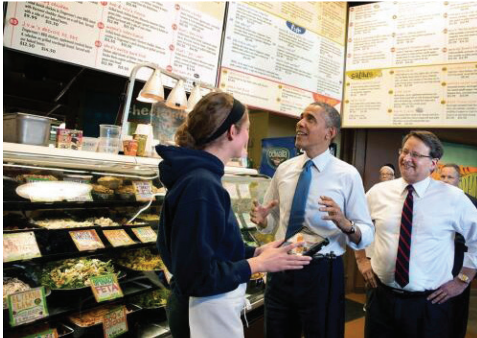
President Obama on #SmallBusinessWeek: "We renew our commitment to helping these vital enterprises thrive."